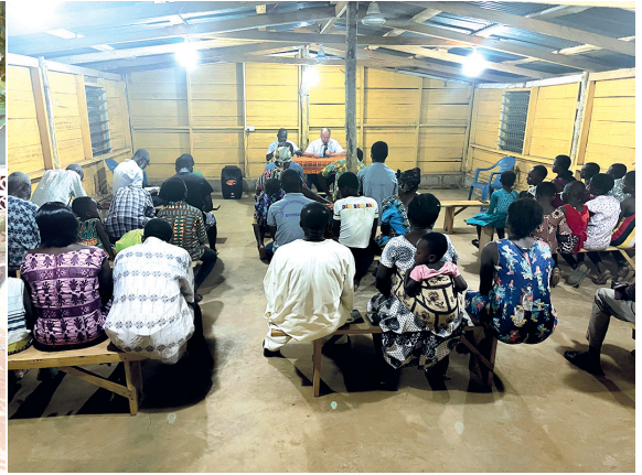
Accra, Ghana JIM FRANTTI

and fame. The prophets of the Old Testament and the teachings of Jesus were models for the ascetic life that took shape in late antiquity and later for the monastic institution. In monasteries, instead of taking care of everyday things, life was consecrated to a life of prayer and worship of God (cf. Matt. 6:25).