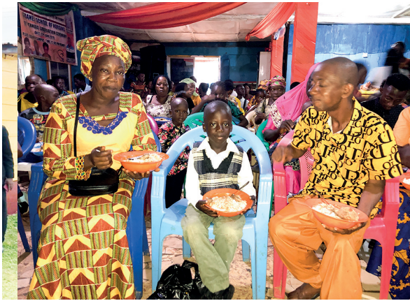
Freetown, Sierra Leone