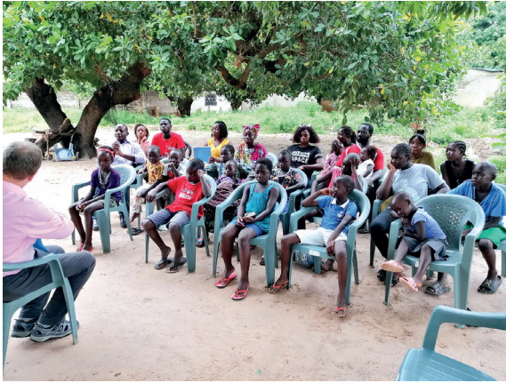
Kunkunjan, Gambia