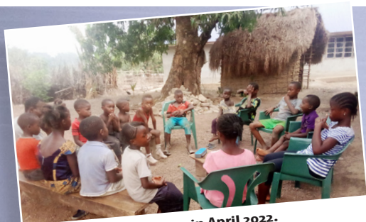
Mosongo, Sierra Leone in April 2022.